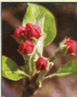
5. Pink Bud