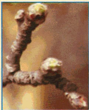
1. Silver Tip