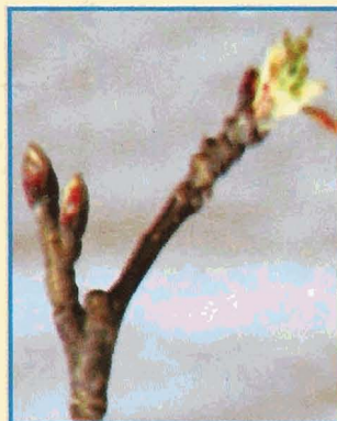
3. Half-Inch Green Tip