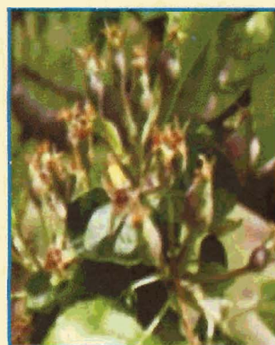
8. Fruit Set

Horticulture Information Service, Department of Horticulture, Himachal Pradesh, Shimla-2