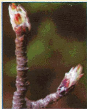
2. Green Tip