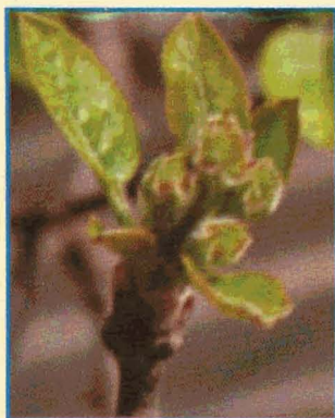
4. Tight Cluster