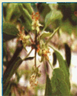
7. Petal Fall